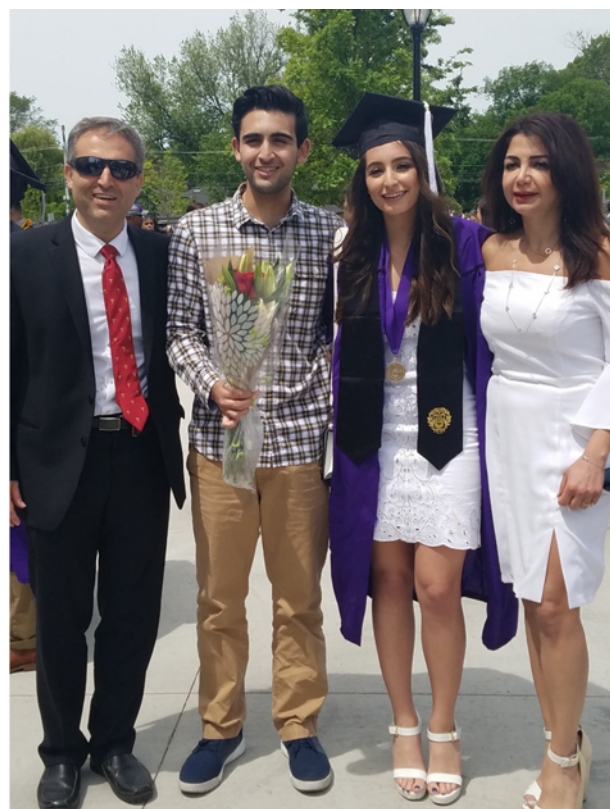
Figure 3. My family at my daughter's graduation from Northwestern University. Spring 2019.

sition publicly, since the new government would sentence anyone who was in opposition to jail or possibly death. In the years following the Revolution, Iran and Iraq got into a bloody war that lasted eight years. At that time, the shadow of the new regime and the devastating war had made Iran a tense country. Through certain channels, my mother got my younger brother and myself out of Iran when I was 16 years old. We eventually joined the rest of my family in the United States five months after leaving Iran. My experience leaving Iran at a challenging time reinforced my desire and aspiration to excel in my educational endeavors.