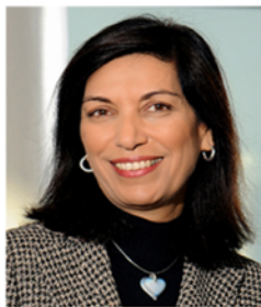
Huda Zoghbi Feb 2022