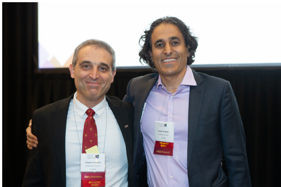
Figure 6. Incoming ASCI President, Sohail Tavazoie.

Despite the challenges this virus has brought to the whole world, there is another aspect of this pandemic that cannot be ignored, and that is misinformation. A number of people in positions of high power have taken the liberty of making