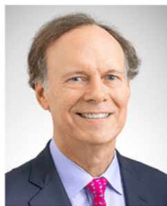
William Kaelin Sept 2021