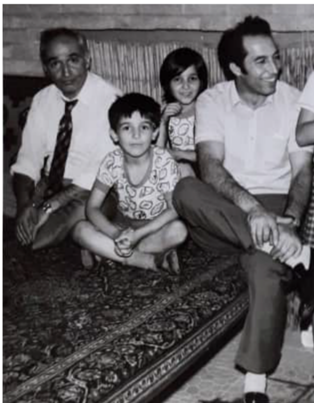
Figure 2. Picture of me along with my father, my uncle, and my sister the night before our older sister (not in the picture) immigrated to the US. I was 6 years old at the time.