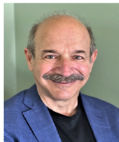
Bruce Beutler March 2022